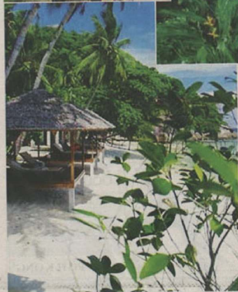
Clockwise from top left: A Tree Top Chalet; a Sarang Villa offers privacy; pavilions by the sea.