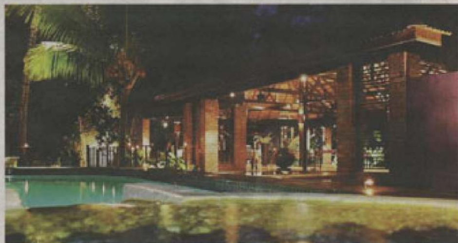
The Tamarind Terrace.

Q Berjaya Air flies two times daily and 14 times a week to Pulau Tioman. Holiday packages and flight tickets can be booked via www.Berjaya-Air.com